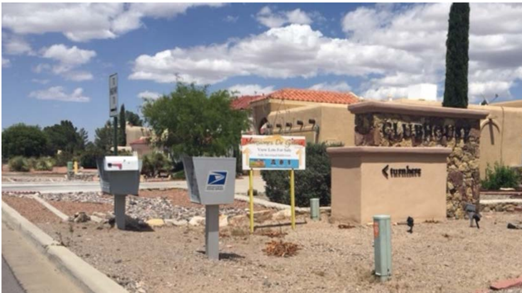
Example of an area to be improved by professional landscape design

Landscaping projects cost money. Unfortunately, only about a third of the property owners in Picacho Hills are members of the PHPOA. We need to increase our dues-paying membership! Please urge your neighbors to contribute to this effort by joining the PHPOA. We will also welcome any ideas you may have for financing the landscaping initiatives that will be outlined in the MLP. Currently, we are discussing whether to create a fund for this purpose.